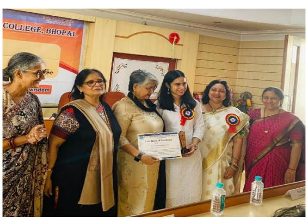
SHGC Hosts Intercollege Poetry Extravaganza "KALAMKARI" in Commemoration of International Women's Day